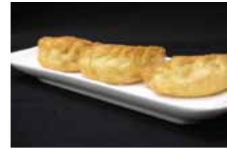
Gyoza Spec: 20g/30g Seafood, Veg, Chicken Packing: 100Pcs/Box