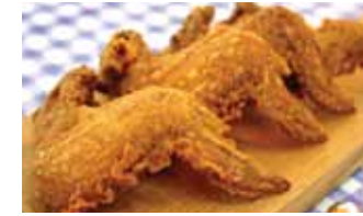
Coated Three Joint Wing Packing: 2Kg/Bag X 5Bags/Carton