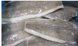
Arrowtooth flounder Fillet ( Atheresthes Stomias ) Spec: Skin On/Skinless 300/400, 400/500, 500/600 IQF, IVP Packing: 10Lg/Carton