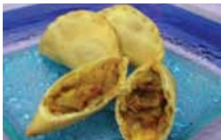
Curry Puff (Epok Epok) Potato/Chicken/Sardine Spec: 35g/40g Packing: 100Pcs/Box