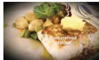
Halibut Fillet ( Reinhardtius hippoglossoides ) Spec: 400/500, 500/600, 600/700 Packing: IQF/IVP 10Kg/Box