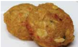
Thai Crab Cake Spec: 28g~30g Packing: 100Pcs/Box