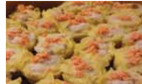
Siew Mai (Chicken, Salmon, Scallop, Shrimp) Spec: 15g, 20g, 25g Packing: 100Pcs/Box