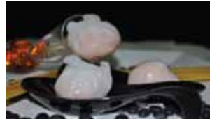
Premium Har Kow (Shrimp) Spec: 16g, 22g, 25g Packing: 100Pcs/Box