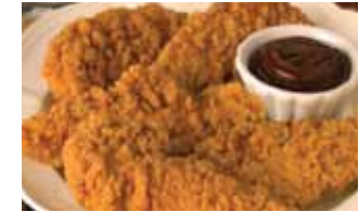
Chicken Finger Spec: 22g/24g/6kg/Box