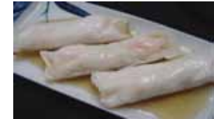
Japanese Cheong Fun Spec: 35g Packing: 100Pcs/Box