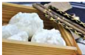
H.K Style Char Siew Pau (Chicken) Spec: 45g Packing: 100Pcs/Box