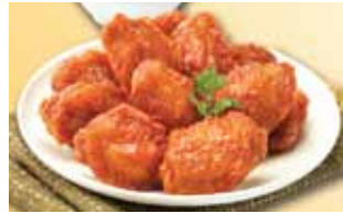
Honey Wing (Mid Joint) Packing: 2kg/Bag X 5Bags/Carton