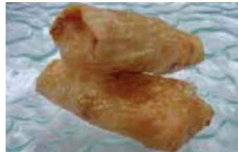
Japanese Seafood Bean Curd Spec: 35g Packing: 100Pcs/Box