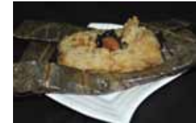
Lotus Leaf Lo Mai Kai (Chicken) Spec: 80g Packing: 100Pcs/Carton