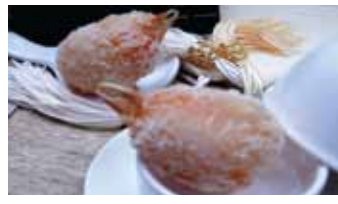
Legend Crab Nail Spec: 25g Packing: 100Pcs/Box