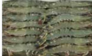
Tiger Prawn (HOSO) Spec: 16/20, 21/25, 26/30, 31/40, 41/50 Packing: 1Kg/Box X 10Boxes/Carton