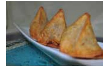
Punjabi Samosa (Potato) Spec: 30g/50g Packing: 120Pcs/100Pcs/Box