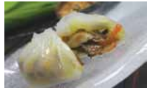
Vegetarian Xiao Long Pau Spec: 25g Packing: 100Pcs/Box