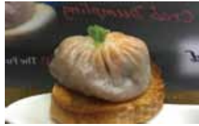
Chili Crab Xiao Long Pau Spec: 35g/Pc Packing: 50Pcs/Box