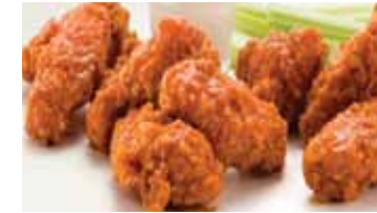
Hot Wing Mid Joint Thai Style Packing: 2Kg/Bag X 5Bags/Carton