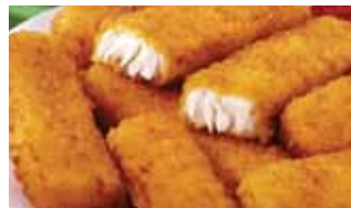
Fish Finger Spec: 20g/24g/225Pcs/Box