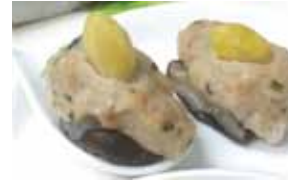
Gingko Boat Dumpling (Chicken) Spec: 28g~30g Packing: 100Pcs/Box