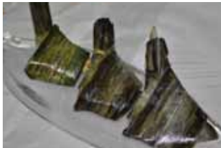
Pandan Chicken (Thai Style) Spec: 40g Packing: 200Pcs/Box