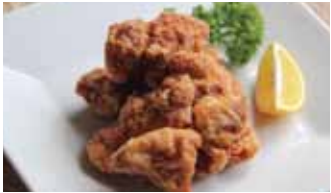
Chicken Karaage Packing: 50Pcs/Pack x 4 Packs/Carton