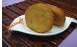
Thai Fish Cake Spec: 25g Packing: 200Pcs/Box