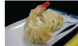
Shanghai Dumpling Spec: 25g Packing: 100Pcs/Box