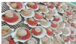
Half Shell Scallop Spec: 7/8, 8/9, 9/10, 10/12 Packing: 2.5Kg/Pack X 4 Pack/Carto IQF