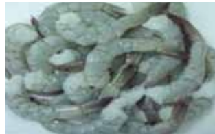
Vannamei Shrimp Meat (PTO) Spec: 31/40, 41/50, 51/60, 61/70 IQF, BQF Packing: 1Kg/Pack X 10 Packs/Carton