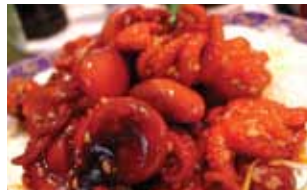
Seasoned Octopus (Chuka Idako) Packing: 2Kg/Box X 5Box/Carton