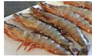
Sea Tiger Prawn (HOSO) Spec: 4/6, 6/8, 8/10, 10/12, 12/15 IQF Packing: 1Kg/Box X 10 Boxes/Carton