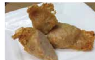
Fupei Prawn Roll (Yuba Prawn Roll) Spec: 35g Packing: 100Pcs/Box