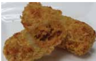
Thai Otah Roll Spec: 25g Packing: 100Pcs/Box