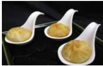
Shanghai Fried Pau Spec: Chicken 30g/Pc Packing: 100Pcs/Box