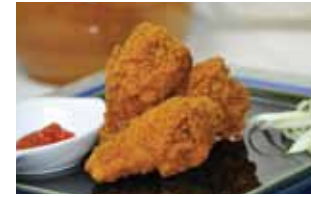
Hot Wing Stick Packing: 2Kg/Pack x 5 Packs/Carton