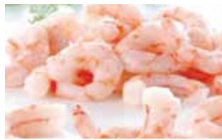
Greenland Shrimp (Pandalus borealis) Packing: 1Kg/Pack X 10 Packs/Carton