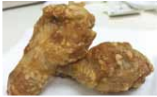
Seasoned Wing Stick Packing: 2Kg/Pack x 5 Packs/Carton