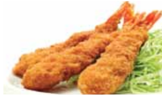
Breaded Prawn (Japanese Tempura) Spec: 20g Packing: 100Pcs/Box