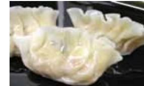
Wanton (Chicken, Prawn) Spec: 20g Packing: 100Pcs/Box