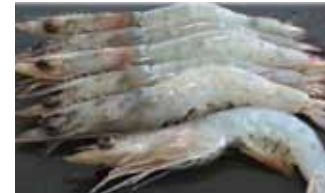
Vannamei Shrimp (HOSO) Spec: 26/30, 31/40, 41/50, 51/60 IQF, BQF Packing: 10Kg/Carton