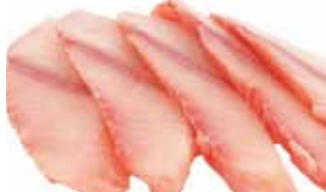
Shark Fillet Packing: 10Kg/Carton