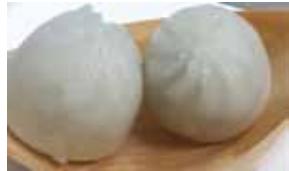
Crystal Dumpling Spec: 30g (Vegetarian & Non Vegetarian) Packing: 100Pcs/Box