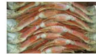
Snow, Crab ( Chionoecetes opilio ) Spec: Cluster L, XL, XXL Packing: 5Kg/Carton