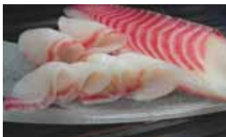
Izumidai Fillet ( Oreochromis Niloticus ) Spec: 6/7oz Packing: IQF/IVP 5Kg/Box