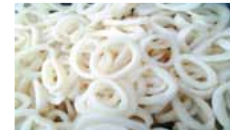
Frozen Squid Ring Todarodes Pacificus Spec: U7 Packing: 1Kg/Pack X 5Kg/Carton