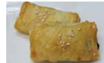
Char Siew Soo (Chicken) Spec: 30g Packing: 100Pcs/Box