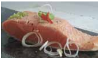
Chum Salmon ( Oncorhynchus Keta ) Spec: Skin On Fillet/Skinless Fillet Portion Cut (Skin On/Skinless) Packing: 10KG/Carton IVP/IQF/BULK PACK