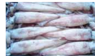
Whole Squid Loligo Spec: 8 – 12cm, 12 – 16cm, 16 – 20cm Packing: 10KG/Carton IQF/IVP/BQF