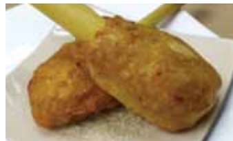
Lemongrass Chicken Spec: 40g Packing: 100Pcs/Box