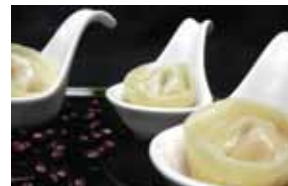
Scallop Dumpling Spec: 25g Packing: 100Pcs/Box