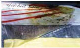
Greenland Halibut Fillet ( Reinhardtius Hippoglossoides ) Spec: 400/400, 500/600, 600/700, 700/800 Packing: IQF/IVP 10Kg/Carton