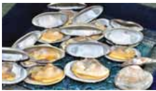
Short Neck Clam (Asari) Spec: 30/30, 40/50, 50/60 Packing: 1Kg/Bag X 5 Bags/Box