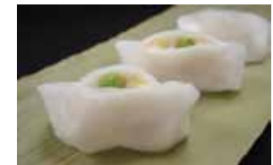
Lobster Dumpling Spec: 20g Packing: 100Pcs/Box