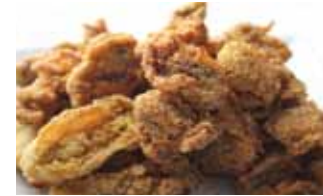
Fried Oyster (Seasoned & Breaded) Spec: 20g~22g Packing: 200Pcs/Box