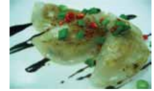
Soon Kueh (Normal/Vegetarian) Spec: 35g/ Packing: 100Pcs/Pack