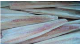
Alaska Pollock Fillet ( Theragra Chalcogramma ) Spec: Skinless Fillet Packing: 10KG/Carton IVP/IQF/BULK PACK