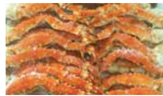
Alaska King Crab Spec: Cluster: 300/400, 400/500, 500/600 600/700 & 800Up Single Leg: l, XL, XXL Packing: 5Kg/Carton