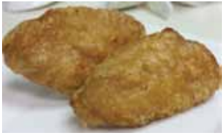
Seasoned Mid Joint Packing: 2Kg/Pack x 5 Packs/Carton