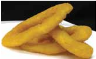
Breaded Calamari Packing: 1Kg/Bag X 5Bags/Carton