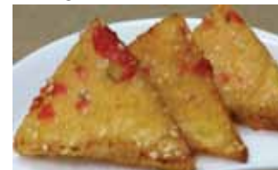
Thai Seafood Toast Spec: 13g ~ 15g Packing: 200Pcs/Box