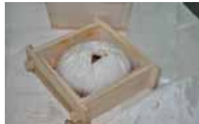
Jumbo Chicken Pau Spec: 150g, 250g Packing: 30Pcs/Box