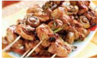
Chicken Yakitori Spec: 25g Packing: 100Pcs/180Pcs/Box