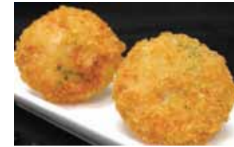
Croquette Salmon/Potato Spec: 30g Packing: 100Pcs/Box