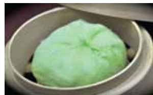
Kaya Pau Spec: 30g Packing: 100Pcs/Box