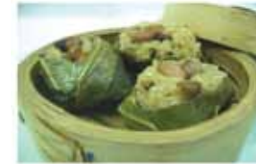
Teochew Glutinous Rice Spec: 35g/ Packing: 100Pcs/Box