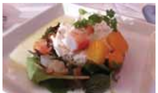
Alaska King Crab Meat ( Paralithodes platyus ) Spec: Leg Meat/Cluster Meat Packing: 500g/Bag x 10Bags/Box