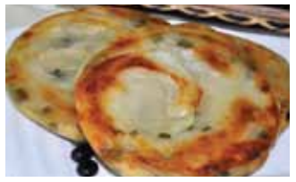
Spring Onion Pan Cake Spec: 50g Packing: 100Pcs/Box