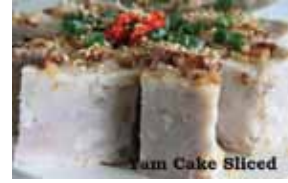
Yam Cake (Slice) Spec: 70g/Pc Packing: 40Pcs/Box