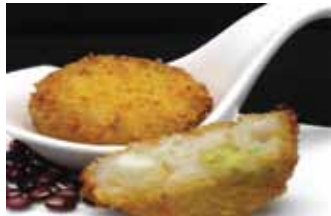
Scallop Croquette Spec: 30g Packing: 100Pcs/Box