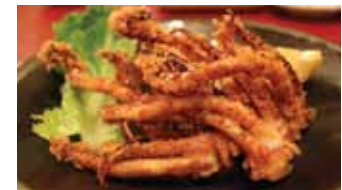
Squid Karaage Packing: 1Kg Bag X 5Bags/Carton