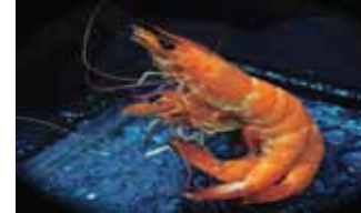
Cooked Prawn (HOSO) Spec: 31/40, 41/50 IQF Packing: 1Kg/Box X 10Boxes/Carton