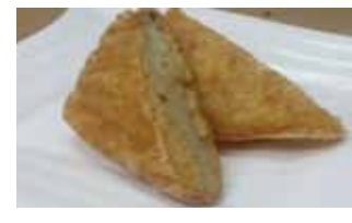
Prawn Treasure/Chicken Treasure Spec: 25g~30g Packing: 100Pcs/Box