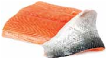
Chum Salmon Fillet ( Oncorhynchus keta ) Spec: 800/900, 900/1000, 1000Up Portion Cut Skin On/Skinless IQF, IVP Packing: 10Kg/Carton