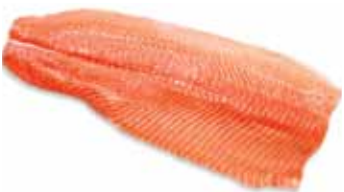
Atlantic Salmon ( Chinook Salmon ) Spec: Skin On IQF, IVP 800/1000, 1000/1200, 1200Up 10Kg/Carton