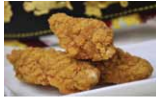
Spicy Wing (Korean) Packing: 1kg/Bag X 5Bags/Carton