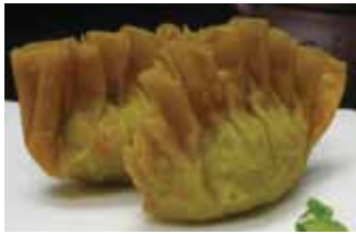
Honey Prawn Spec: 15g Packing: 150Pcs/Box