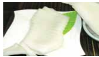
Frozen Illex Squid Tube Todarodes Pacificus Spec: U 5/U 7/U10 Packing: IQF/BQF 10Kg/Carton