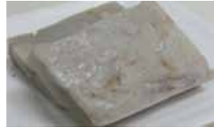
Carrot Cake (Slice) Spec: 70g/Pc Packing: 40Pcs/Box