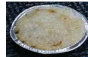
Mini Chicken Glutinous Rice Spec: 30g Packing: 100Pcs/Box