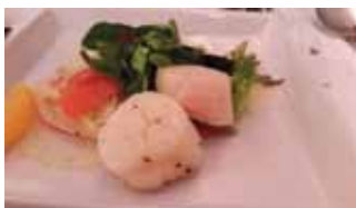
Hokkaido Scallop Meat Spec: 10/20, 20/30, 30/40 Packing: 1Kg/Box X 10Boxes/Carton IQF/BQF