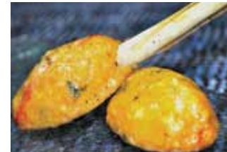
Lemongrass Prawn Spec: 40g Packing: 100Pcs/Box