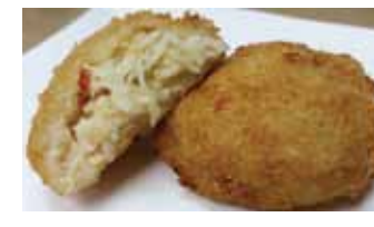
King Crab Cake Spec: 45g Packing: 50Pcs/Box