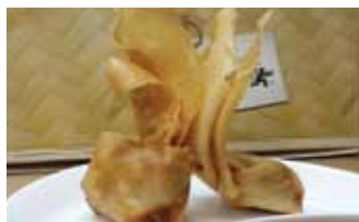
Crispy Shrimp Wanton/ Crispy Chicken Wanton Spec: 20g Packing: 100Pcs/Box