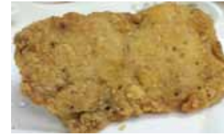
Breaded Chicked Chop Packing: 2Kg/Bag X 5Bags/Carton