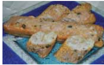
Stuffing You - Tio Spec: 40g/90g Squid/Shrimp/Fish Paste Packing: 40Pcs/Box